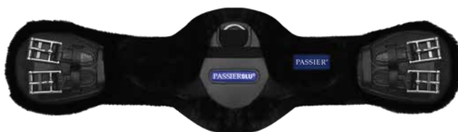
Comfortable and classy: the Saddle Girth Cover for the PASSIERBLU Wave Saddle Girth with lambskin in Black (Pictures: jpg)