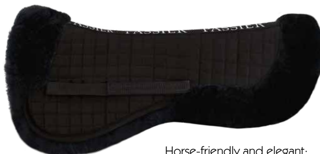
Horse-friendly and elegant: the Lambskin Pad with lambskin in Black (Pictures: jpg)